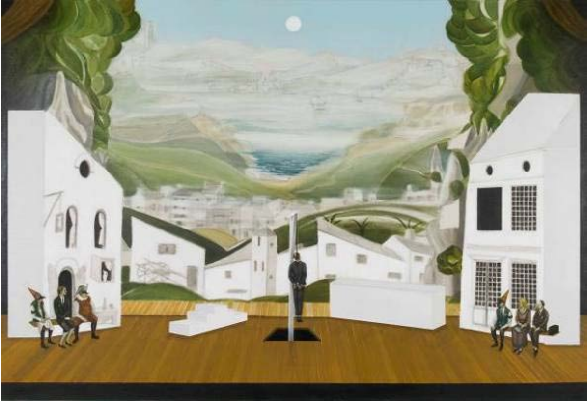
Giocare Su, 2009, Paint on canvass, 206x301cm