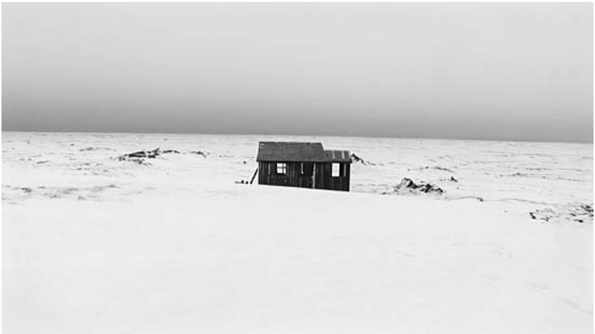
Deathbed, 2006, HDV transferred to Blu-ray or DVD with sound, 20'00"