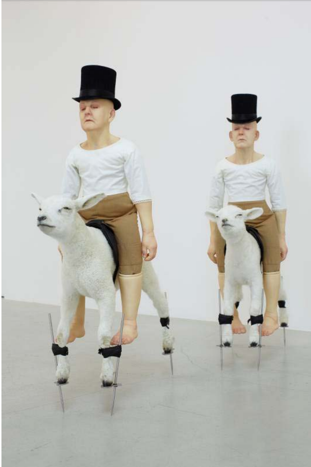
297km (Coming Soon), 2011, Hand painting on ceramics, Stuffed lambs, cloth, steel, 101(h) x80x33cm each, 2 pieces set