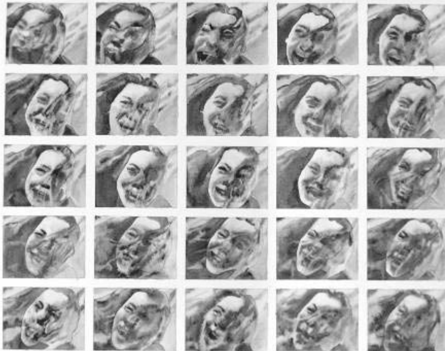
Two Seconds of Pain I, 2008, watercolor on paper, animation video Drawing: 75x105cm (1 sheet),Black&white video with sound, 02"loop