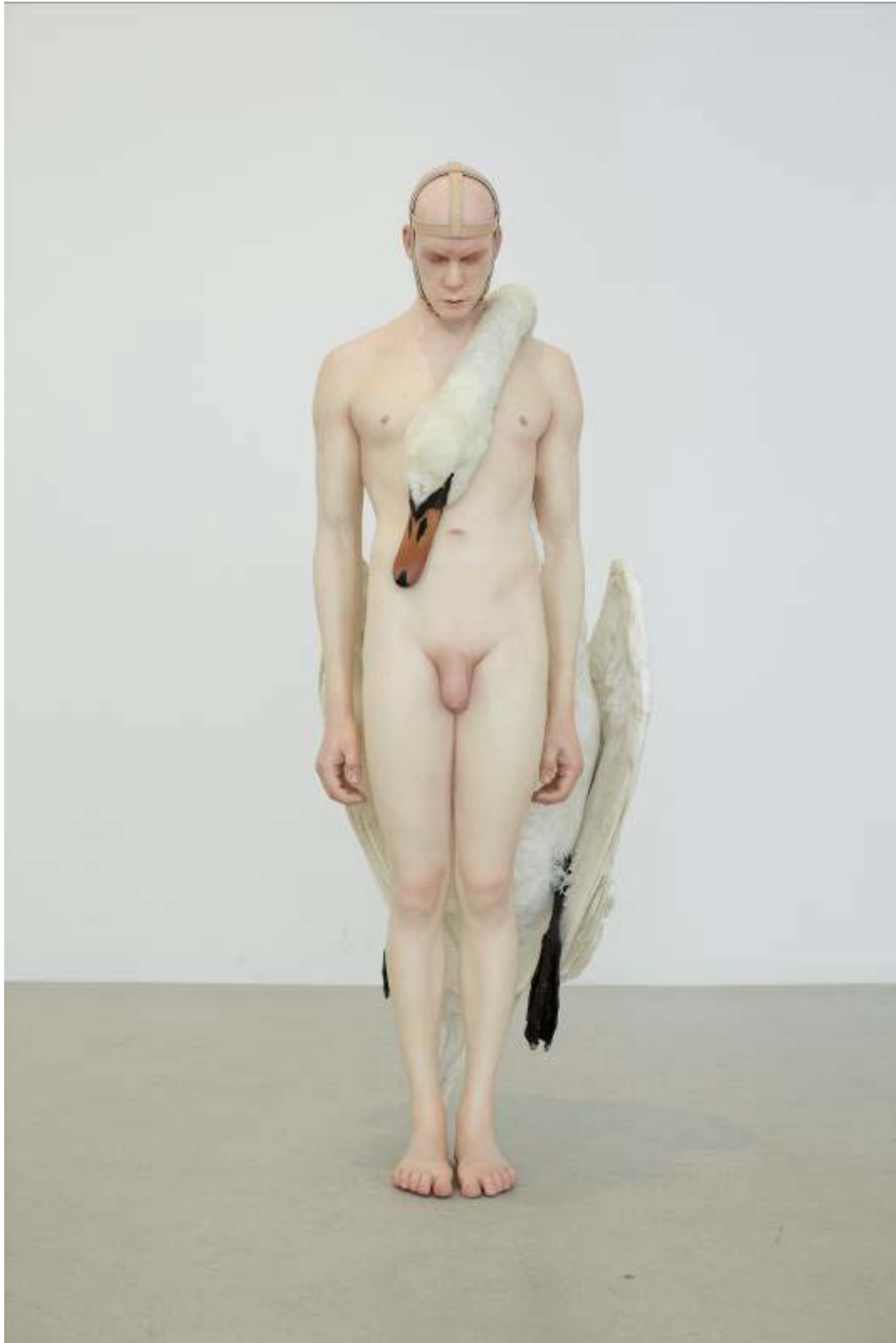
The Gatekeeper Rested His Eyes, and Unauthorized Person Snuck In 2011, Fiberglass, canola, Stuffed swan, 115(h) x50x40cm