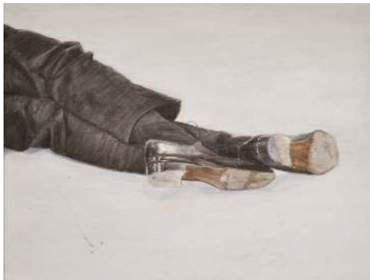
Hotel Savoy, 2010, Oil on Canvas, 70x92cm