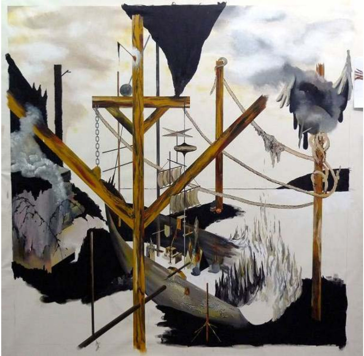
Revolution Blues, 2011, Acrylic on Canvas, Oil painting, Airbrush, 210x210cm