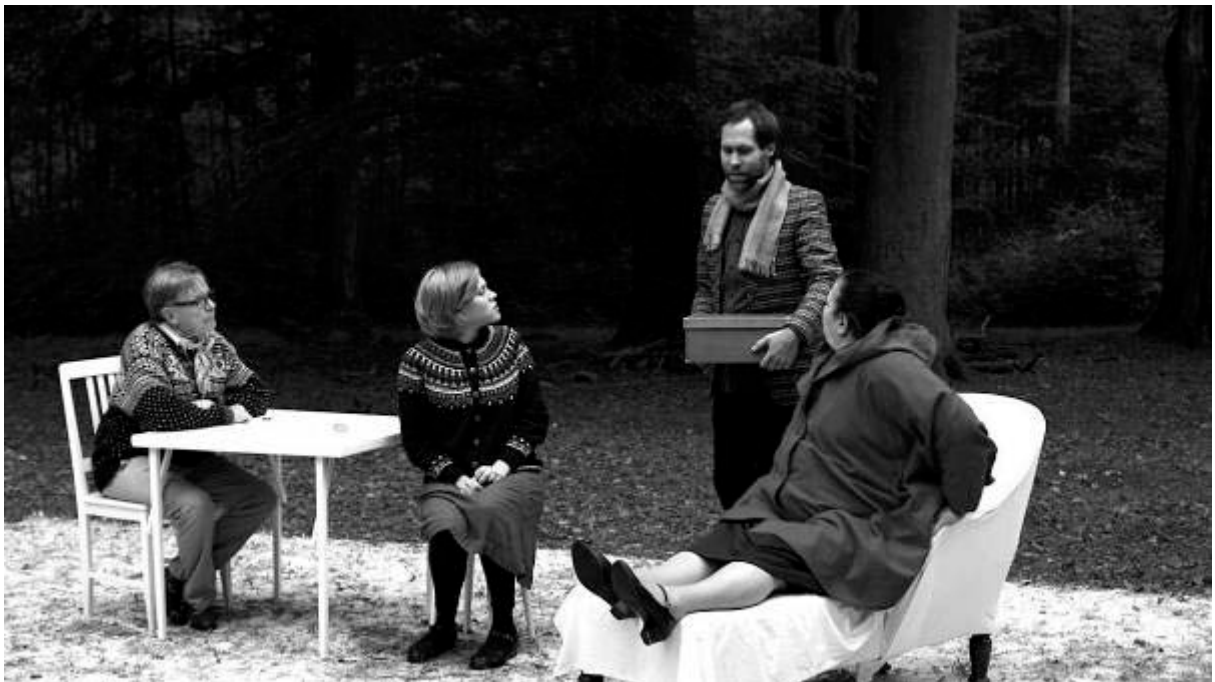
Chorspiel, 2010, black & white HD & DVD Blu-ray with sound, 10'35''