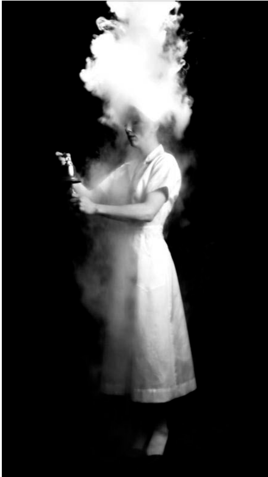
Asylum, 2009, HDV with sound, 20'00" loop