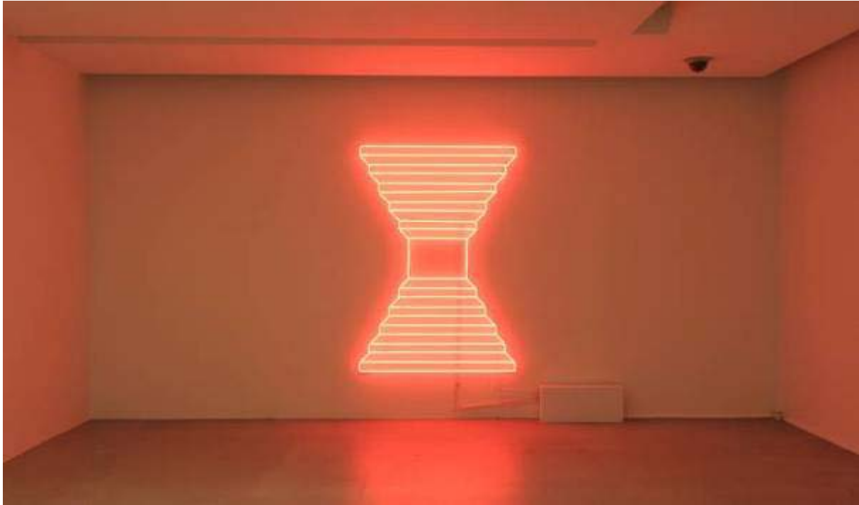
Mercuria, 2009 (2012 Reproduced), Neon, 195x135cm Installation View from the exhibition