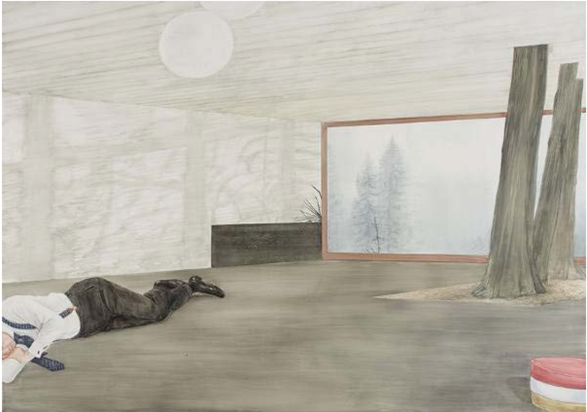
Modern Classics – Sverre Fehn I, 2010, Oil on Canvas, 182x260cm