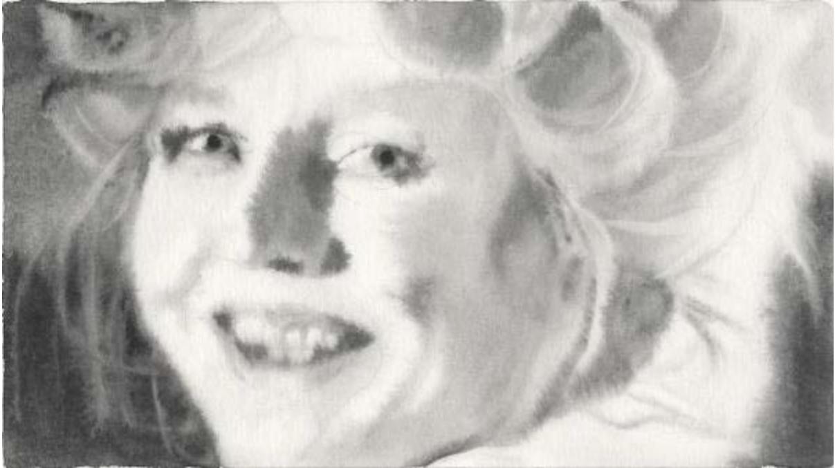
Behind The Laughing Veil, 2011, watercolor on paper, animation video Drawing: 16 pieces set, 21x30cm each, Black&white video with sound, 02"loop