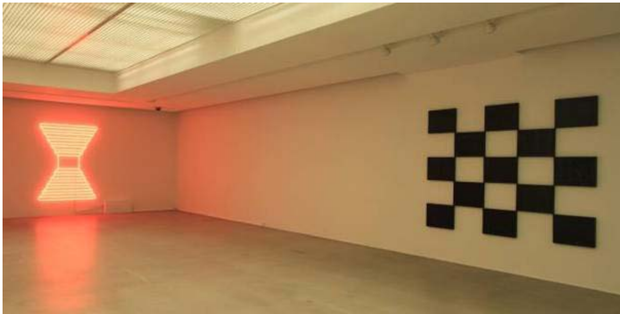
Installation View from the exhibition