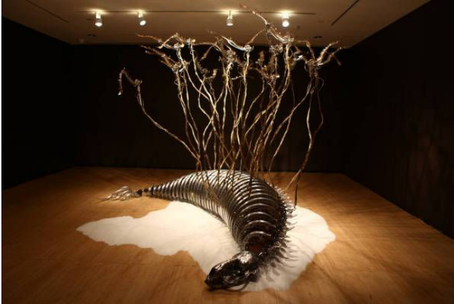
Custos Cavum (2011) metallic material, machinery, electronic devices (CPU board, motor) 220(h) × 360(w) × 260(d) cm ©Choe U-Ram and Gallery Hyundai, Seoul