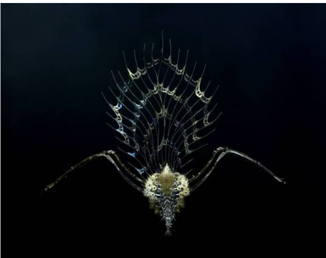
Arbor Deus Pennatus (2011) metallic material, machinery, electronic devices (CPU board, motor) 79(h) × 112(w) × 46(d) cm ©Choe U-Ram and Gallery Hyundai, Seoul