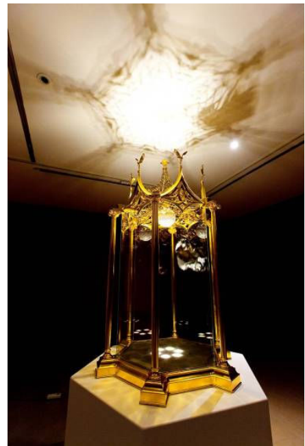
Pavilion (2012) resin, wood, crystal, 24K gold leaf, plastic bag, metallic material, fan, motor, custom CPU board and LED 244(h) × 132(w) × 112(d) cm ©Choe U-Ram and Gallery Hyundai, Seoul