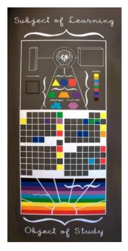
Top: C'mon Language, 2013 (Portland Museum for Contemporary Art); Schema for K, 2015 (REDCAT Los Angeles). Bottom: Subject of Learning / Object of Study, 2010 (Blanton Museum of Art).