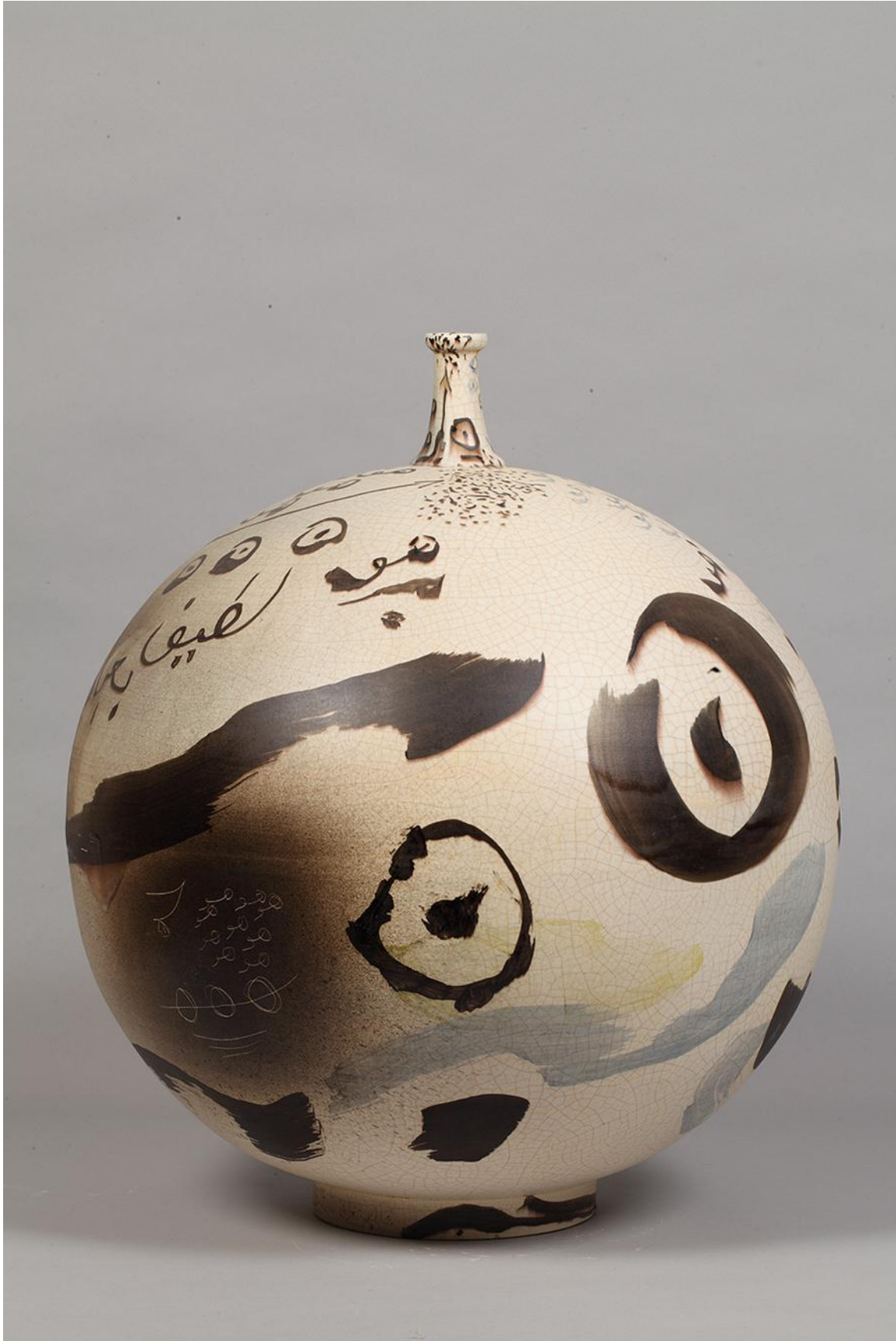
Khaled Ben Slimane, White Rotund I, 2016, ceramics, 58x50x50 cm