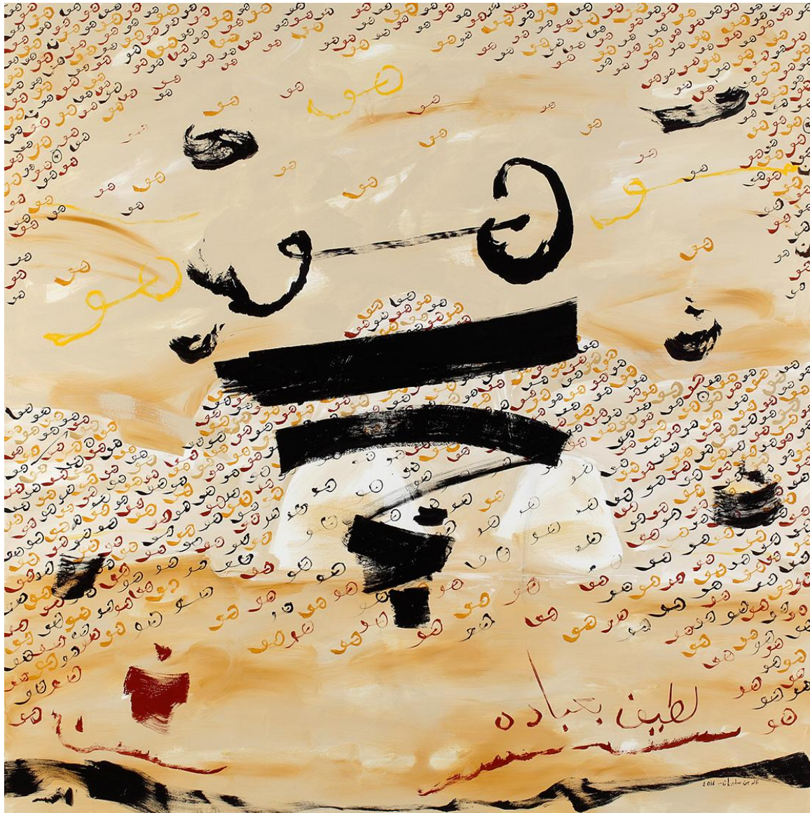
Khaled Ben Slimane, Howa XI , 2016, Acrylic on canvas, 160x160 cm