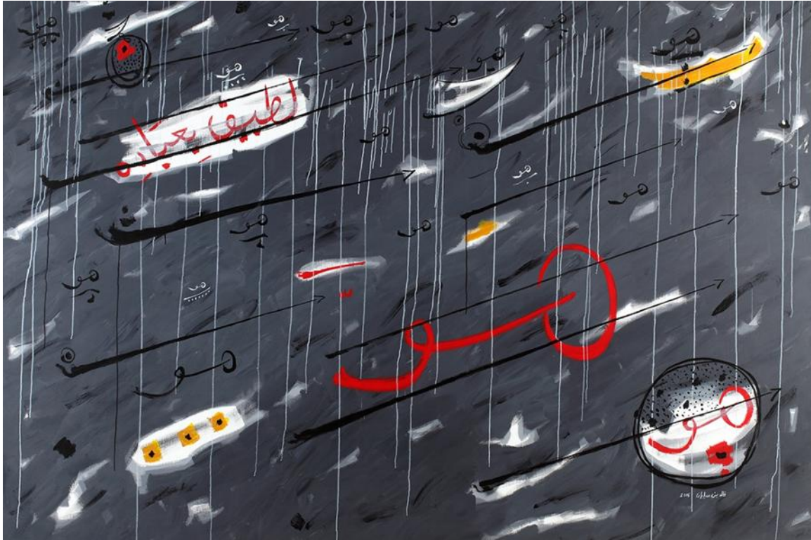
Khaled Ben Slimane, Howa IX, 2015, Acrylic on canvas, 200 x 300 cm