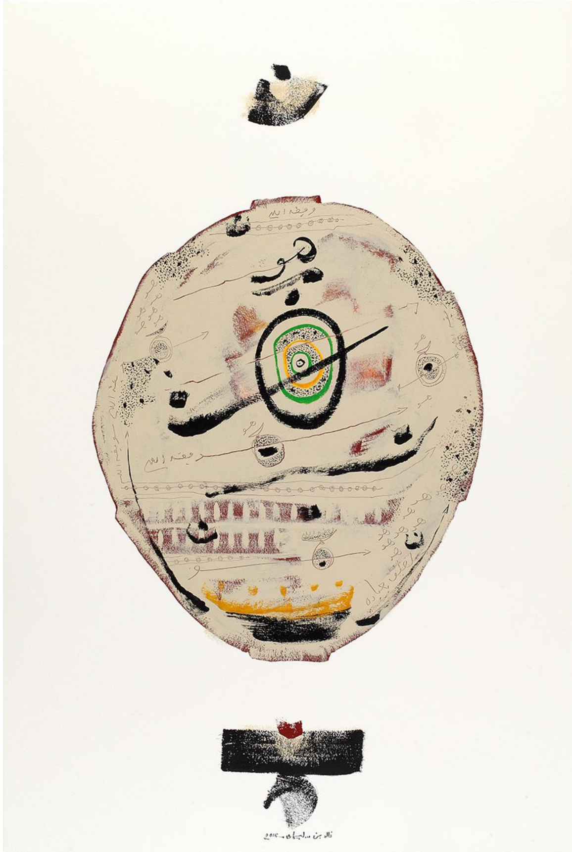
Khaled Ben Slimane, Ascension III , 2015, Acrylic on Arches paper, 152,5 x 103 cm