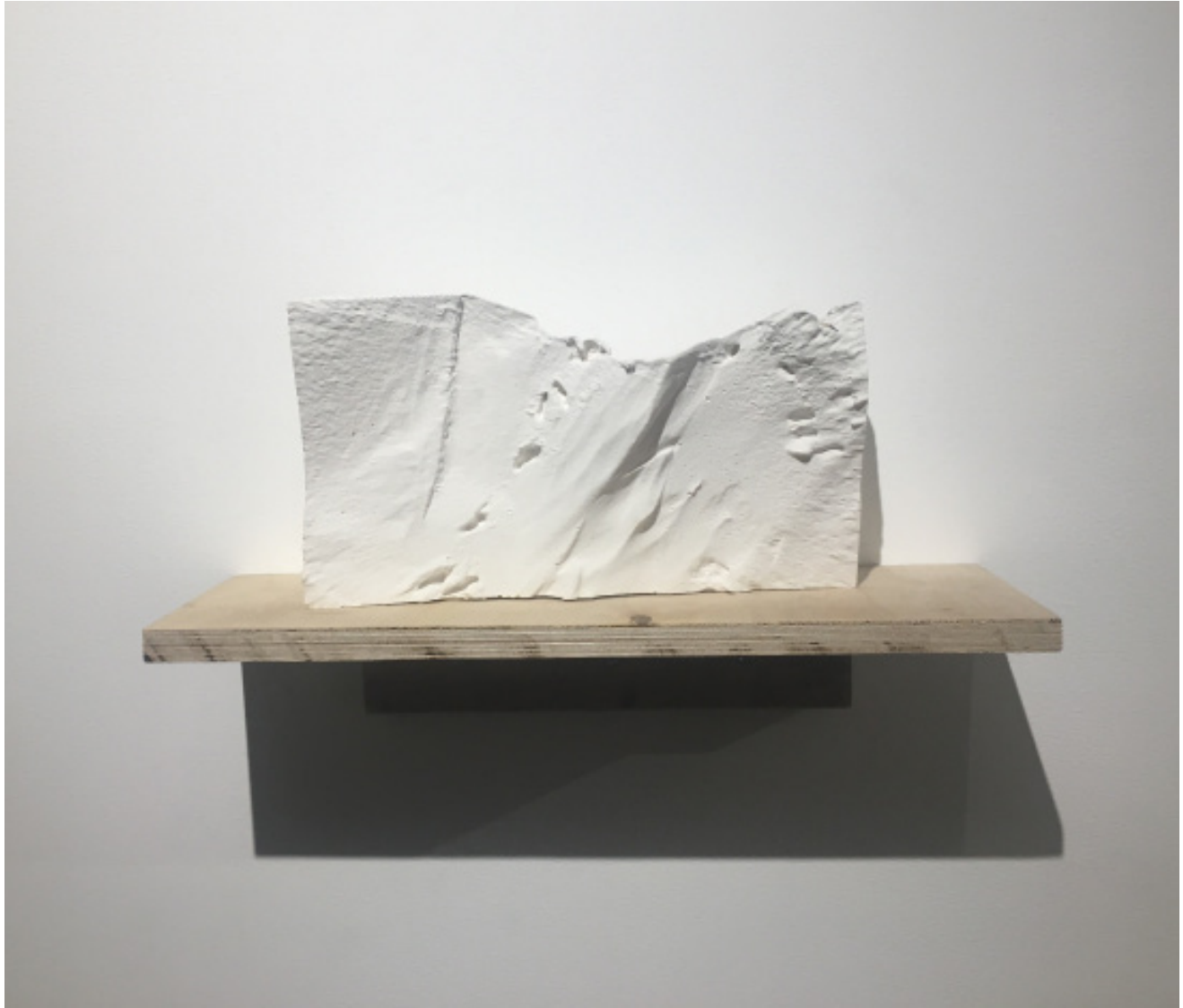
PA System (Alexa Hatanaka and Patrick Thompson) Snowform 1 (series) Edition of 5 (Alexa's footprints), 2019, plaster, 6" x 12" x 2"