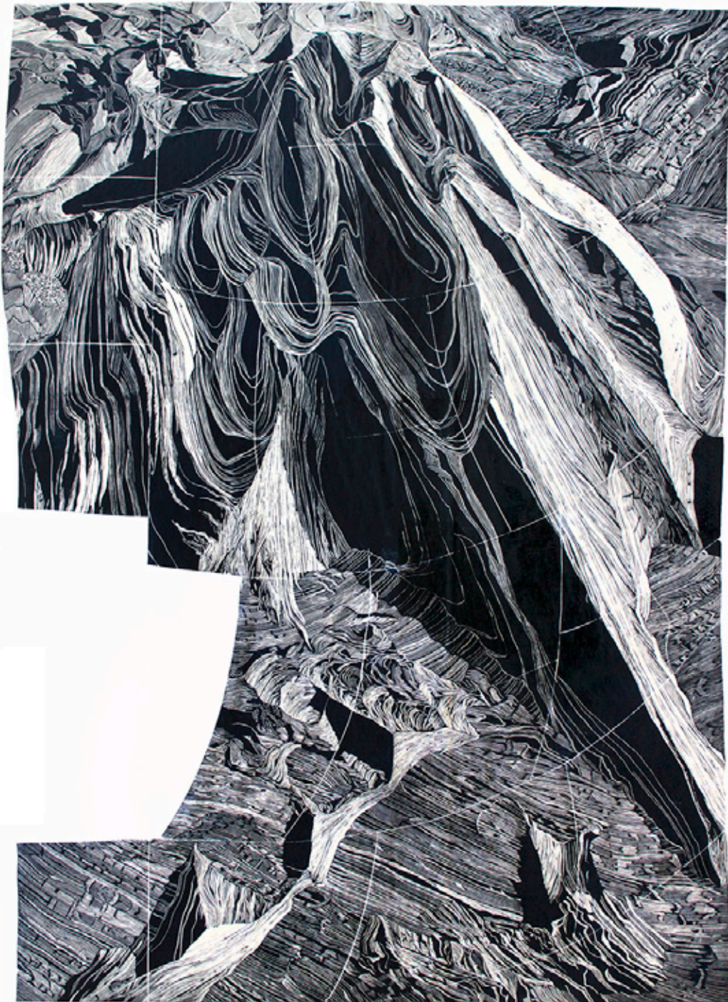
Image: Nuna/Land, Hand - printed linocut print on washi paper, 7.5 ft. x 6 ft.

Linoleum flooring from Peter Pitseolak School in Kinngait (Cape Dorset, NU), which burned down in 2015, was used to create the print Nuna/Land. The image was inspired by a photograph taken by the artists while skiing in Cape Dorset with local youth. The print in the context of an installation was included in the group exhibition, EVERY. NOW. THEN. REFRAMING:NATIONHOOD at the AGO.