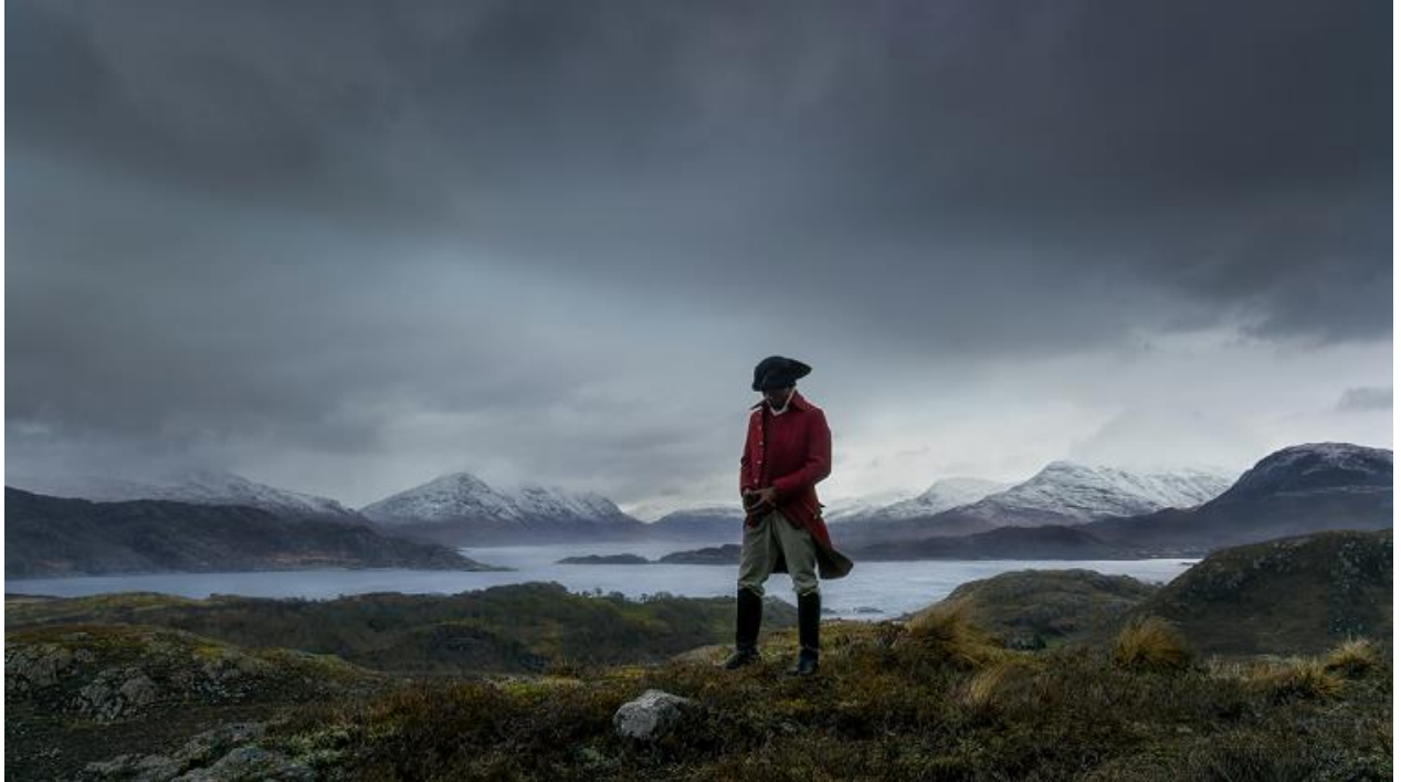
John Akomfrah, Vertigo Sea , 2015, film still

John Akomfrah's three-channel video installation Vertigo Sea (2015) is complex, highly compelling and incredibly timely. Composed of excerpts from films and television programmes drawn primarily from the archives of the BBC natural history unit, along with staged footage shot by Akomfrah, it weaves together multiple narratives, both ecological and political, that portray the ocean as a site of terror and of beauty. Presented at the Venice Biennale in 2015, the work is part of the collection of the National Gallery of Canada.