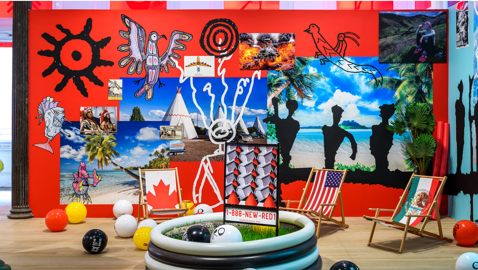
New Red Order, Cover the Earth, 2021. Detail, Feel at Home Here, Artist's Space, 2021.