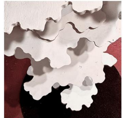
Stacy Latt Savage