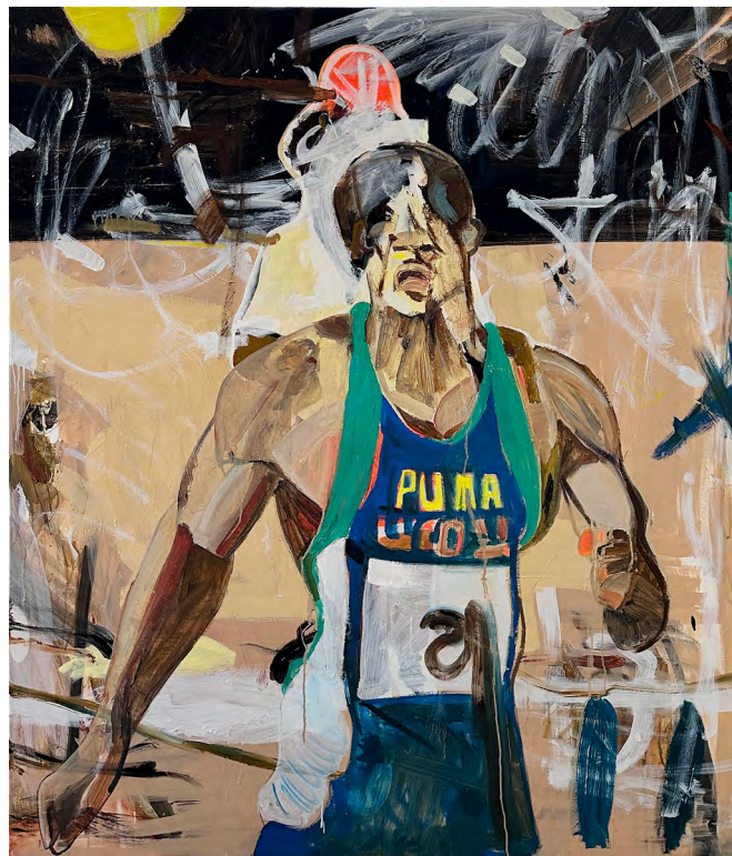
Kuo Yen Fu, News Footage , 2023, Mixed Media on Canvas, 140 x 120 cm, 55 3/25 x 47 6/25 in. Courtesy of the artist and WKM Gallery.

The portrayal of human muscles in art history has a classical aesthetic background, on the other hand, contemporary films carry diverse cultural aesthetics from different