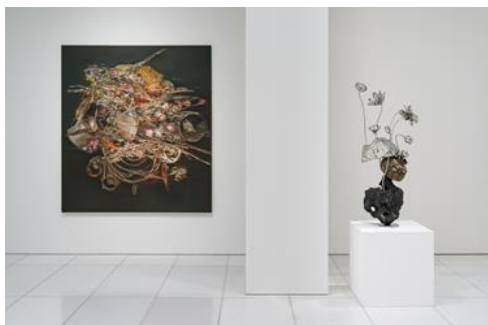
Installation view at ARARIO GALLERY SEOUL (1F)

※ Credit for all Artwork Images: © Subodh GUPTA. Courtesy of the Artist & Arario Gallery.