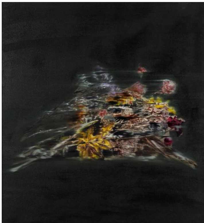
Subodh GUPTA, Inner Garden VII , 2024, Oil on linen, 130 x 120 cm ©2024. Subodh Gupta. Courtesy of the Artist and ARARIO GALLERY