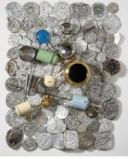
Subodh GUPTA Proust Mapping II (2024) Aluminum, stainless steel, found objects 140 x 24 x 195(h) cm