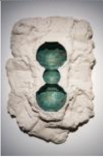
Subodh GUPTA Within this vessel are the seven oceans and unnumbered stars I (2024)

Plaster, copper, steel, patina 61 x 14 x 85(h) cm