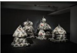
Subodh GUPTA Stupa (2024) Aluminum, plaster Dimensions variable

Utensils, each bearing its own history, memories, and traces of life, evokes long-forgotten memories in those who view them. Gupta recontextualizes ordinary objects as symbolic elements that evoke cultural memory and spiritual resonance. The Proust Mapping series arranges objects on a flat surface to evoke the emotions, memories, and histories inherent within both individuals and communities. By presenting everyday materials, the artwork establishes a dialogical relationship between the viewer and the piece, further reinforcing the inevitable connection between humble domestic labor and the structures of industrial mass production.