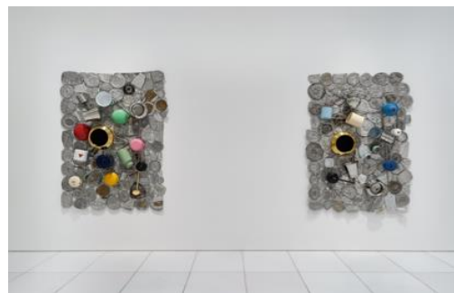
Installation view at ARARIO GALLERY SEOUL (1F)