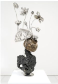
Subodh GUPTA Inner Garden I (2024) Stainless steel, brass, PU Paint 63 x 55 x 131(h) cm

The Inner Garden (2024) series presented in this exhibition comprises of semi-abstract paintings and figurative sculptures inspired by forms found in nature. This series centrally explores the spiritual process of developing an intimate relationship with nature. The paintings visualize emotions derived from reflections on communication and connection with the natural world, drawing upon memories, sensations, and experiences associated with specific objects and places. GUPTA's new paintings show at the center of each canvas, still-life forms depicted in fluid, dynamic shapes, with the distinctive composition and expressive techniques symbolically revealing the resilient power, perseverance, and restorative qualities of nature.