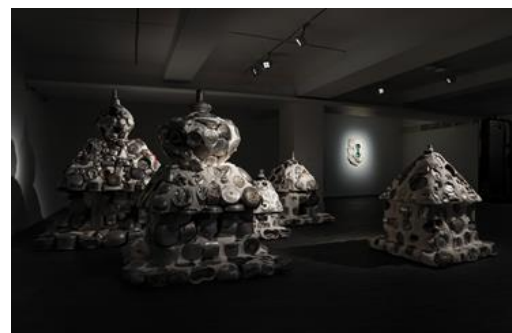
Installation view at ARARIO GALLERY SEOUL (B1F)