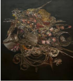
Subodh GUPTA Inner Garden V (2024) Oil on linen 200 x 180 cm