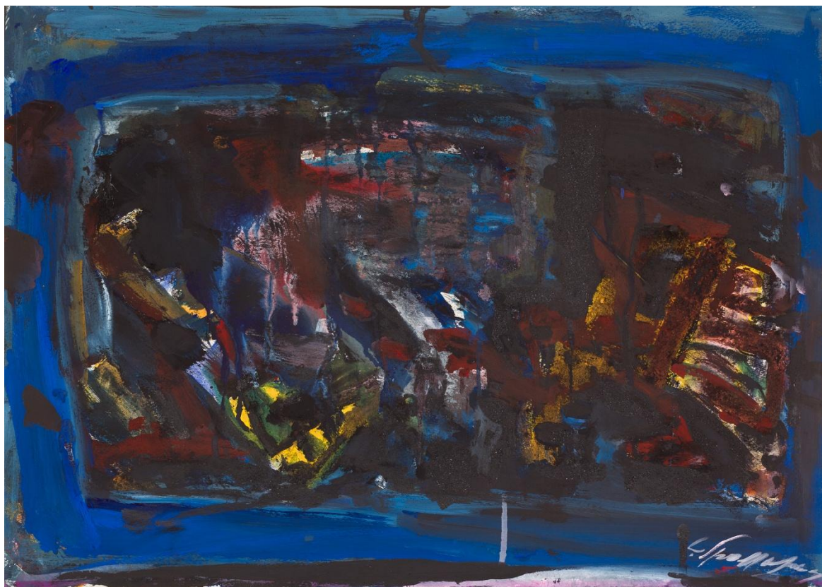
Luigi Spazzapan, Tempera n. 2 , 1958, tempera on paper, cm 55x77

PREVIEW: WEDNESDAY 23 / 04 / 2025, H. 18 – 20 FROM 24 / 04 / 2025 TO 10 / 05 / 2025