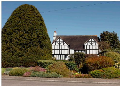
Cul de Sac 2024

Private View: Saturday 11th October 2 - 4pm