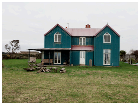
Circling Saturn 2021